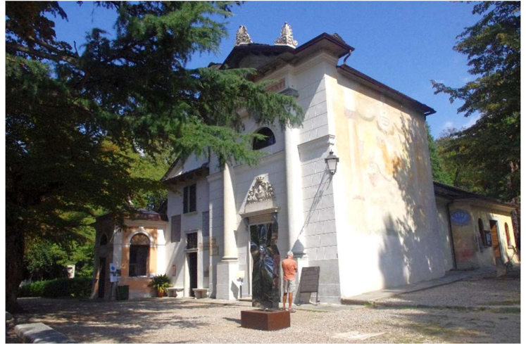
Chapel I is dedicated to the birth of St Francis

A path leads up from the town to the Sacred Mount through an alley of hornbeam trees and under an arch before passing the church of St Francis and St Nicolao. The route proper lies a little further on and begins with a chapel dedicated to the birth of St Francis. As you follow the route winding its way through the garden each chapel unfolds a stage in the life of the saint illustrated by frescoes and polychrome figures.