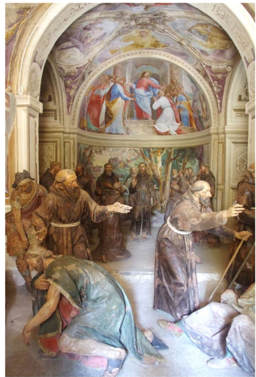
Chapel VI: St Francis sends out the brothers to preach