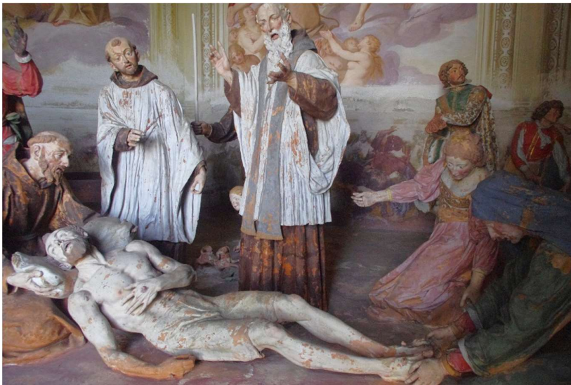
Chapel XVII: Death of St Francis