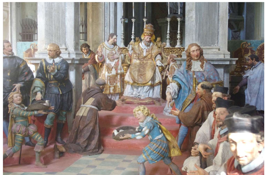
Chapel XX: Canonisation of St Francis

At first, visiting all 21 chapels seemed rather daunting on a hot day in September. However, once we had started, fascination soon set in. I don't suppose that many visitors to Orta find their way to the Sacred Mount, which is a pity as they don't know what they are missing. This is how the Community of Franciscan Friars, who care for the Sacred Mount of Orta describe it in their guidebook.