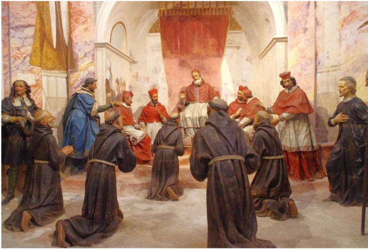
Chapel VII: Innocent III approves the project of St Francis