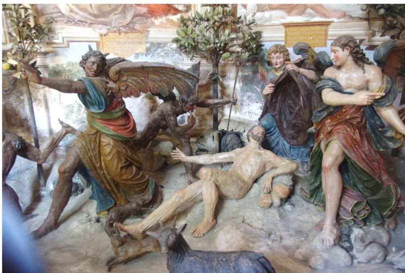
Chapel X: St Francis struggles with temptation by the Devil.