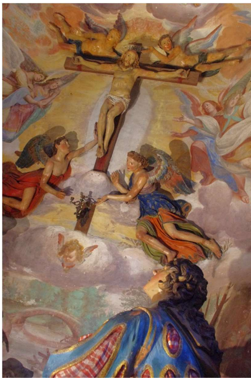
Chapel II: Christ speaks to St Francis from the cross